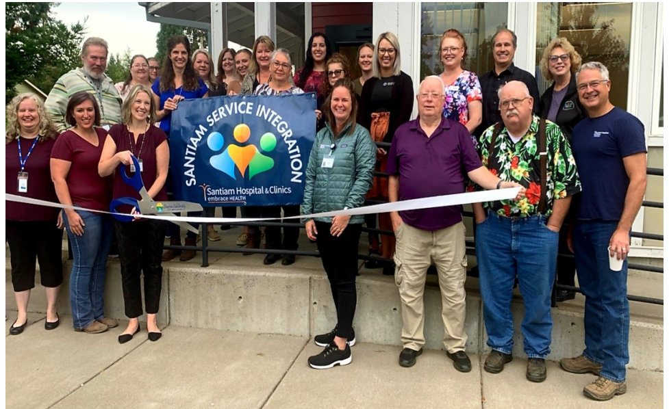
Above: Scio 2022/2023 Service Integration Team picture.