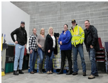
Right: Members of Disaster Services and Santiam Canyon Long Term Recovery Group were able to travel to the After the Fire Conference in California.