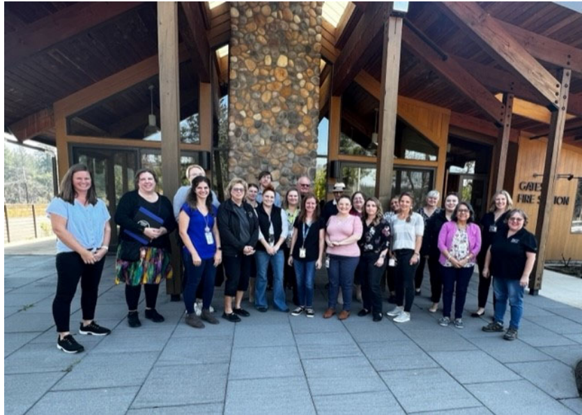
Above: 2022/2023 Santiam Canyon team photo at Gates Fire Hall.