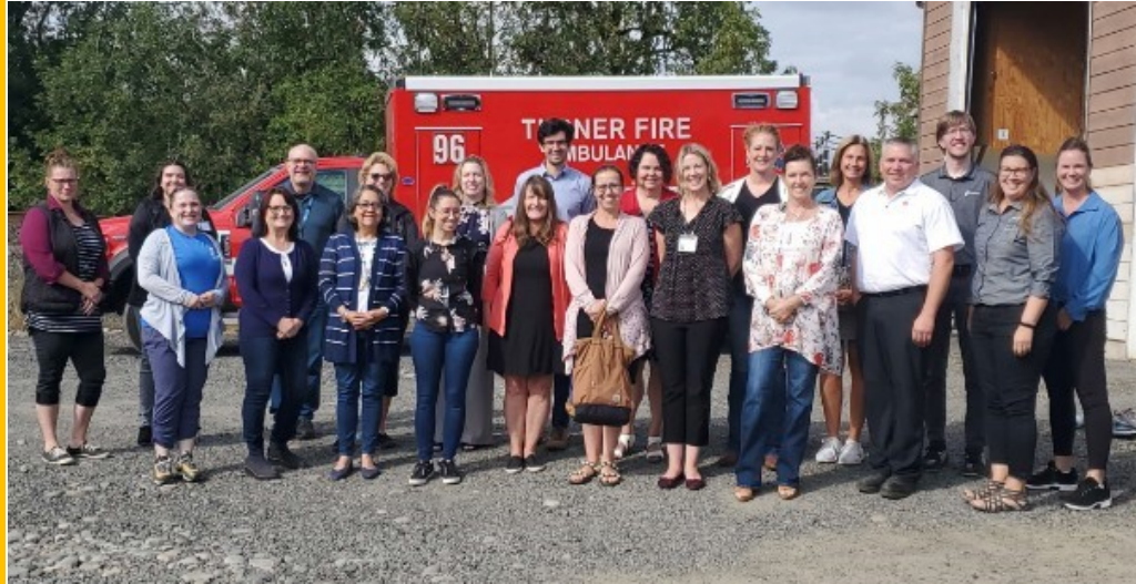
Above: Cascade Service Integration Team Photo September 2022.